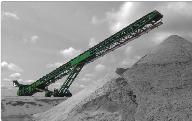
42" X 125' HD Wheeled Stacker - Benin, Africa

Visit www.mccloskeyinternational.com to get in touch with a McCloskey representative to start designing the stacker you need to get the job done.